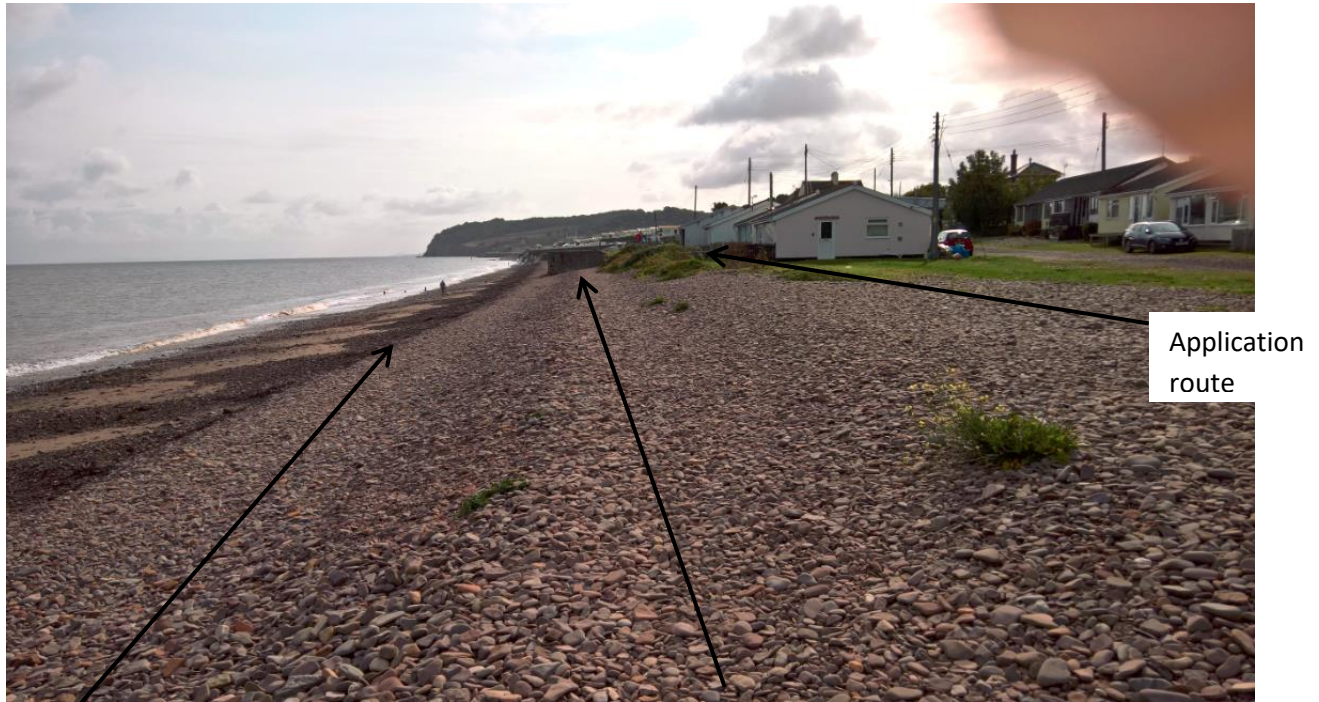
High water mark for 7 September 2017